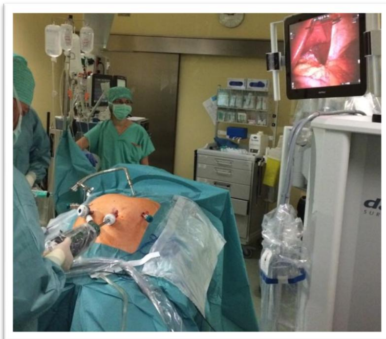
FlexArm Plus adds to OR and procedure efficiency

Another example of how Mediflex is REDIFINING RETRACTION!