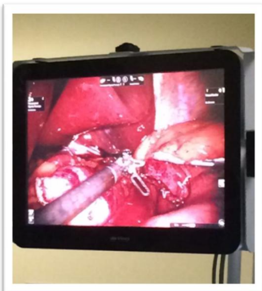
Nathanson Hook provides efficient, atraumatic liver retraction